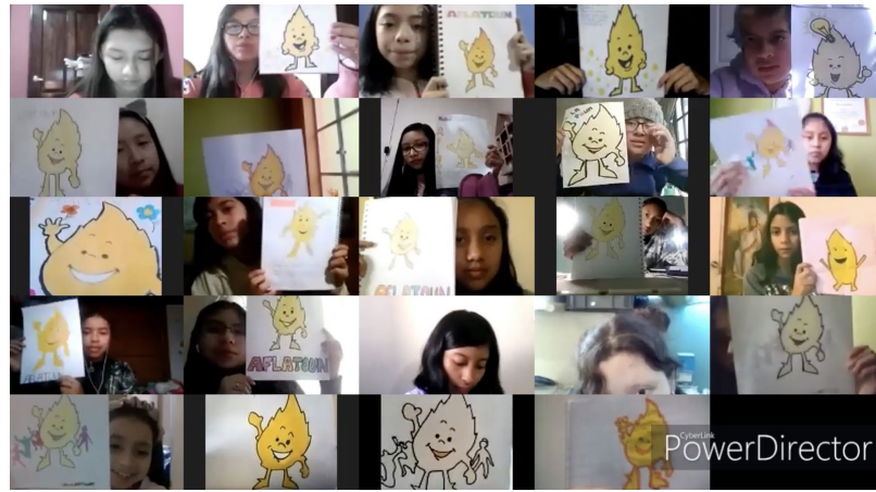
Photo: Students from Socorro Xela, one of our partner schools, participating in our financial literacy program (Aflatoun).

Last year Guatemala saw some turbulent times, such as the impact of the COVID-19 pandemic as well as violent storms and a volcano erupting . These challenges reaffirmed a commitment to persevere both by the local communities and external resources. BFBF was proud to be a part of the solution by funding a new digital platform that is critical to our students in continuing their education. Overall, 1300 students are now able to access their courses online.