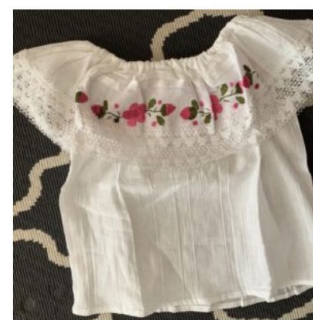
Handmade Guatemalan Children's Clothes