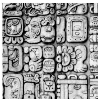
Guatemalan Notecards (BW) $15.00