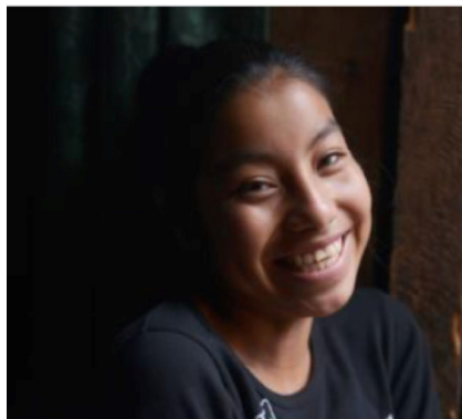
Student at Ninos de Guatemala, one of our partner schools.

BFB Foundation is offering a new pilot program to 30 middle school students at Socorro San Andreas. Intensive English language immersion will be a powerful supplement to their current school curriculum, one we hope to expand to our other partner schools.