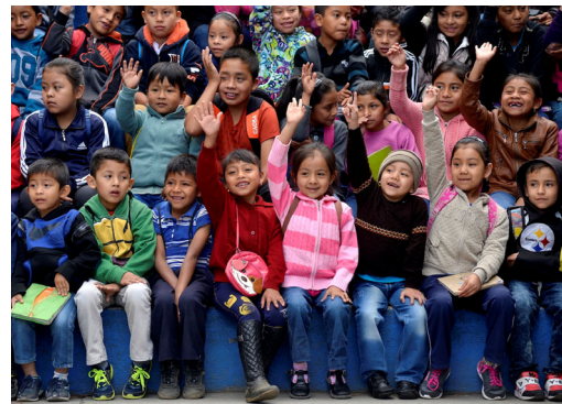
Students at Ninos de Guatemala